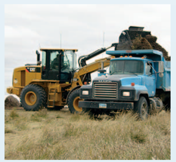
O&M heavy equipment at work