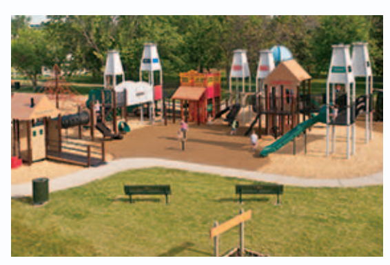
Williston playground.

picnic shelter was constructed. New Johns Lake was further developed with an ADA accessible picnic shelter and ADA fishing pier. Information kiosks were placed in four locations for the convenience of visitors.